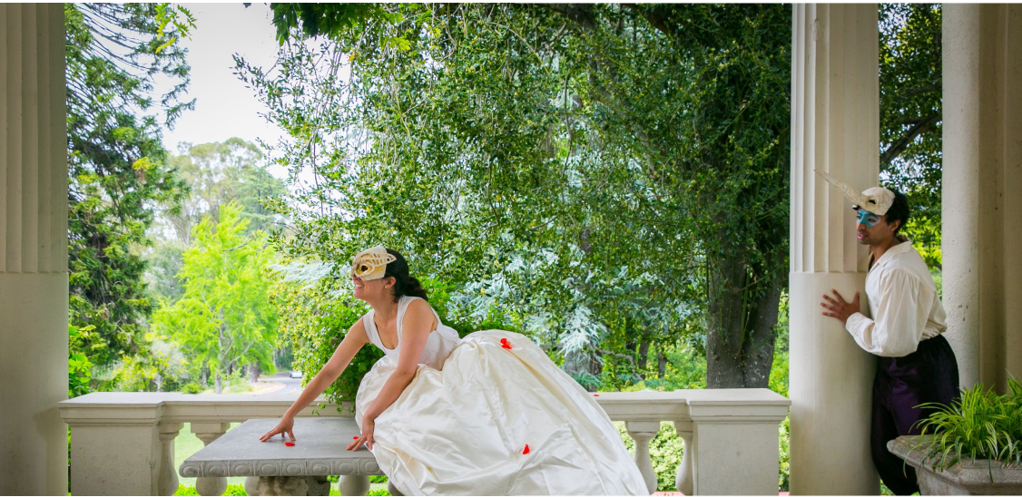
Wherefore art thou? An interactive production of 'Romeo and Juliet' comes to Montalvo Arts Center.

There is no other star-crossed love affair which has been retold and re-interpreted as Romeo and Juliet . Inspiring numerous renditions throughout the years, William Shakespeare's tragedy tells the tale of two lovers destined for despair. From school plays, Broadway and box-office blockbusters, Romeo and Juliet has remained a timeless classic.